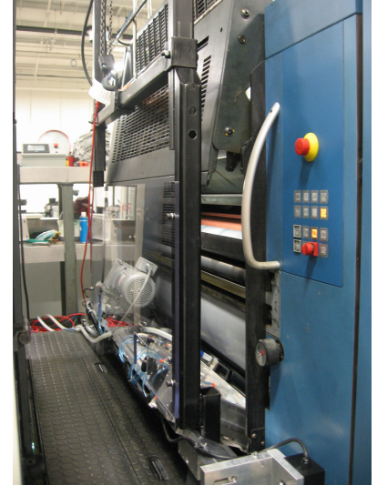
Compact and retractable

Special materials all inline, over or under your offset inks, in ONE PASS!