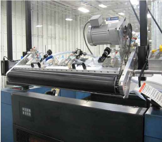
Chambered Anilox System

Today, once considered special printing enhancements like UV inks and gloss or other protective coatings have become commonplace. Maybe you don't have UV yet, but you probably already have a coater at the end of the press (if you don't – see SLIC+ below). However, in order to remain profitable and keep a competitive edge, you need to differentiate your capabilities. After all, you can't "outprint" your competition. The way to profitability, is to convert more into each printed sheet. The best way to do that is with SLIC - the moveable coating device that can be added to any offset printing unit.